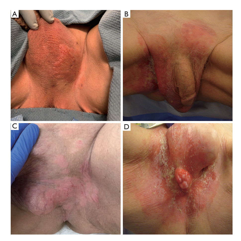
Figure 1 Genital EMPD can present as a well delineated or poorly defined erythematous lesion that may affect the (A) scrotal, (B) suprapubic, (C) inguinal or (D) perineal regions of the body. EMPD, extramammary Paget's disease.

low as 0.12 per 100,000 people and represents 21% of primary scrotal cancers and 2% of primary vulvar cancers, respectively (5-7). With regards to gender and racial preponderance, Asian men seem to have a fourfold increased risk of being diagnosed with EMPD when compared to their Caucasian counterparts (1,8). Previous studies have also reported a female predominance in Caucasian populations (M:F ratio of 1:2–1:7) with the opposite being true among the Asian population (M:F ratio of 2:1–4:1) (5). EMPD represents 6.5% of all cutaneous Paget's disease and it predominantly affects patients between ages 50 to 80 years, with a peak age of 66 years old (9-11). The most common sites affected by EMPD is the vulva (65%), followed by the perianal region (20%) and subsequently the penoscrotal and groin areas (14%) (12).